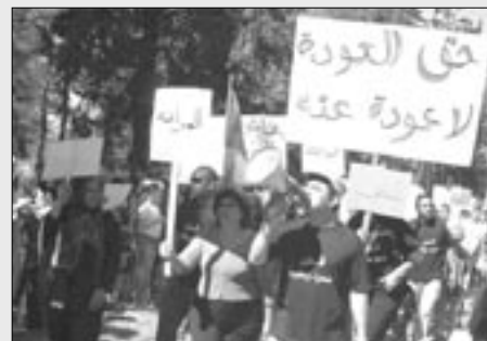
Annual Return March to the Palestinian depopulated village of Umm az-Zeinat, March 2006.

Over 2,500 participated in the 2006 return march of the internally displaced Palestinians organized annually by the Association for the Defense of the Rights of Internally Displaced Persons in Israel (ADRID) to mark the Palestinian Nakba on Israel's independence day. The march was broadcast live on Arab satellite TV.