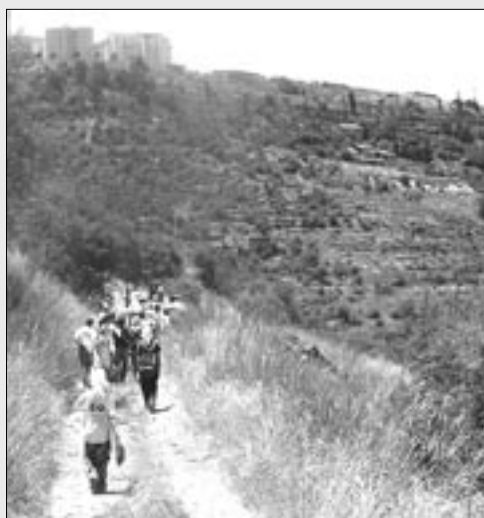
Return March to the Palestinian depopulated village of Lifta\Jerusalem, May 2006.