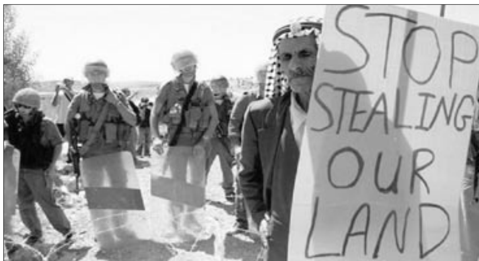
Palestinians protest against building the Wall on their land, Bil'in Village\Ramallah, 2005.

T he Nakba (catastrophe) stands for the destruction of the economic, social, political and cultural fabric of Palestinian society in 1948, when the western powers of the time permitted and encouraged, in violation of international law, the replacement of Palestine by a colonial settler state, i.e. the state of Israel. 58 years later, in May 2006, while Israel and the international community are again set to destroy Palestinian society, Palestinians commemorate the Nakba of the past and the Nakba of the present.