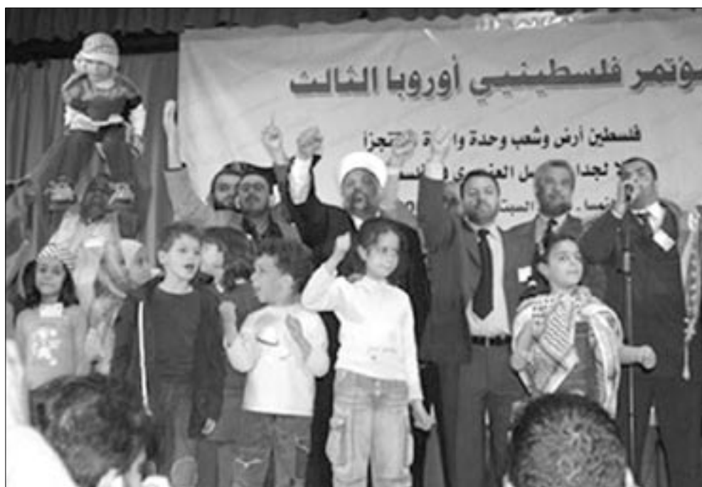
Vienna conference of Palestinian communities in Europe, May 2005.

left to work in Europe with contracts offered in cooperation with the governments of Jordan and Germany, or through a Swedish-supported assistance program to Palestinian refugees. A large portion of these workers remained in Europe.