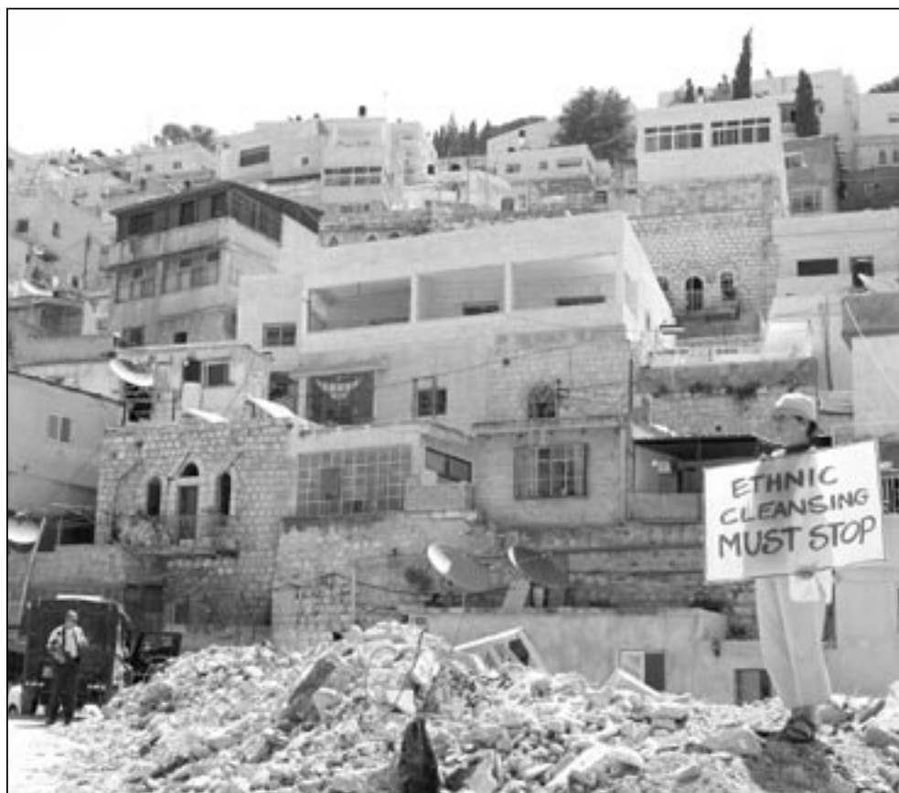
Demonstration Against House Demolition in al-Eisawiyah village\Jerusalem 2005.

For many years, the term al Nakba, the catastrophe, seemed a satisfactory term for both the events of 1948 in Palestine and their impact on our lives today. I think, it is time to use a different term, 'The Ethnic Cleansing of Palestine'.