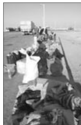
Belongings of Palestinian refugees fleeing Iraq on the side of the road in "no man's land", 2005.

For weeks in No Man's Land along the dangerous road between Baghdad and Syria and in tents we became one family.