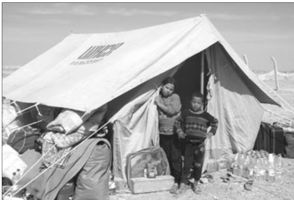
Palestinian refugees fleeing Iraq stranded in "no man's land" between Iraq and Syria, 2005.