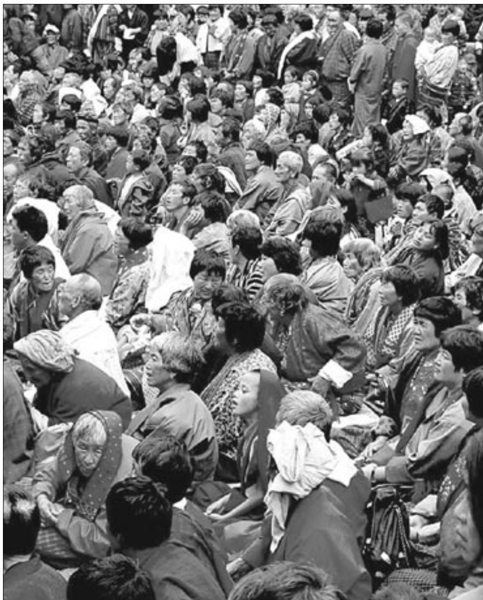
Bhutanese refugees in Nepal holding elections for their camp representatives, 2006.

People previously recognized as Bhutanese were re-classified as "Illegal Immigrants" under the provisions of the nefarious 1985 Citizenship Act implemented in the 1988 census.