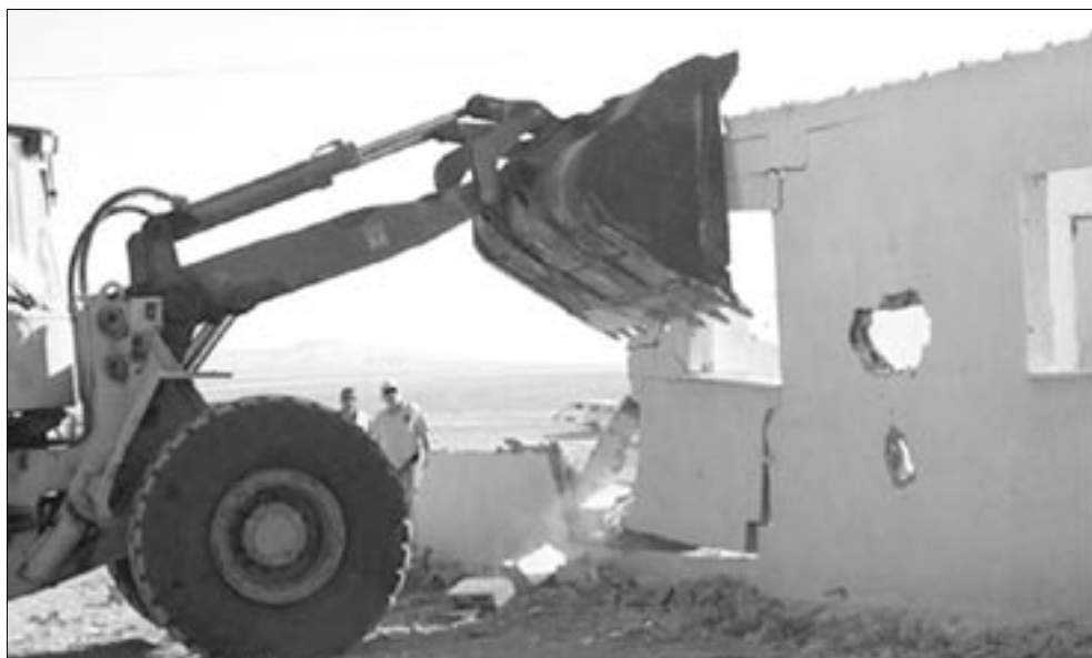
Israeli police demolish the houses of Palestinian Naqab Families, October 2005.

the land; most were gathered in fenced areas while some displaced groups continued to live on their native land. The first group surrendered to "modernization and settlement solutions" while the other group resisted and stayed on their property. As a result of the peace treaty with Egypt, Israel had to evacuate its airforce bases in the Sinai. They chose the land of Tel Al Milh village in the Naqab as the site for their new military installations. The population of Tel Al Milh was removed and concentrated in the towns of Kasifa and Ararah. They built Nefatim airforce base on the ruins of Tel Al Milh. I consider these villagers Internally Displaced Persons (IDP).