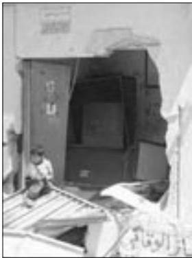
UNRWA food distribution center damaged by Israeli shelling, Jenin camp, 2002.

would likely be materially far worse off without any donor assistance. Humanitarianism alone, as the UN Secretary General Dag Hammarskjöld keenly observed in 1959, however, will not bring about a solution for refugees or to the conflict itself.