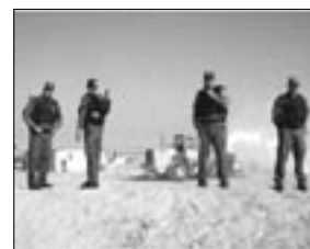
Israeli police demolish the houses of Palestinian Naqab Families, October 2005.

Prof. Isma'il Abu Saa'd, Ben-Gurion University, explains that the education system rests on employing education as a tool to remove people from the unrecognized villages by adopting a "temporary school" model. This involves 19 elementary schools that serve the population of 45 unrecognized villages; they are wood, tin, or concrete structures without appropriate classrooms and facilities. Many unrecognized villages lack schools. 6,000 children have to cover long distances daily: eight and nine year old children