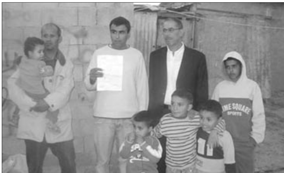
Palestinian Naqab family receives a demolition order for their house, October 2005.

These eyes gazing at the Naqab, gazing at home in longing, passion and pain. They are the eyes of the natives, the original people of the home and the land holding tight to its past, present and future. Greedy are the eyes of the authority, desiring to end life in the Naqab, as it is currently lived, to uproot its people and fence them in Ghettos.