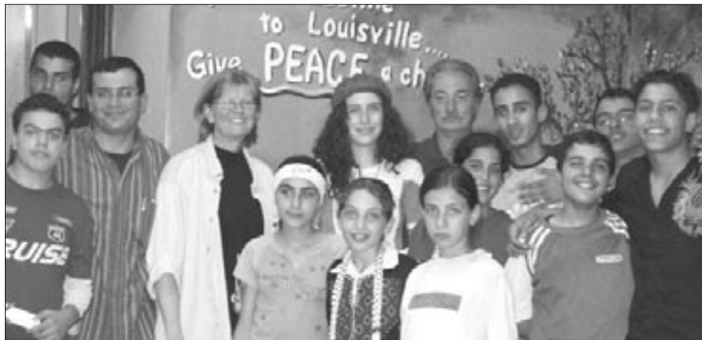
al-Rowwad toured the U.S and stayed at the UrbanSpirit, promoting a community festival, 2005.

I was born under occupation, and I will do everything possible or impossible to change this.