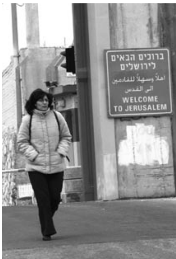
The Wall located in occupied Bethlehem imposes new boundaries between Bethlehem and Jerusalem, 2005.