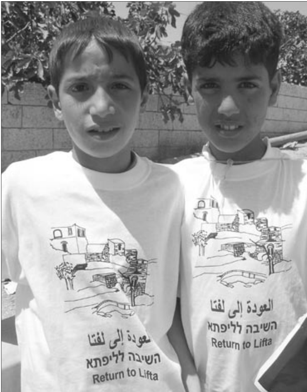
Return March to the Palestinian depopulated village of Lifta\Jerusalem, May 2006.

has expropriated huge new tracts of occupied land. This Wall has turned cities like Qalqilya in the West Bank into ghost towns, and thousands of refugees have been created for the third and fourth time in the refugee camps in Gaza over the last five years. Yet it is not simply in the building of the walls and checkpoints by Israeli occupying forces or the different roads created for Jews and Arabs on Arab land, or the use of specially constructed bulldozers that rip up Palestinian orchards and olive groves on a daily basis and demolish hundreds of homes, or the imprisoning of thousands of political prisoners, or the daily murder of Palestinian civilians which demonstrates the relentless consistency, but in the way the total Israeli military and political machinery is dedicated to destroy Palestinian resistance to their project.