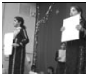
al-Rowwad participating in a community festival, 2005.

Starting from this concept, Alrowwad began its beautiful resistance against the ugly Israeli occupation and its devastating effects on the Palestinian population, especially its children. Art provided a “safe” medium of expression and a beautiful alternative to the images continuously disseminated by the media about Palestinians.