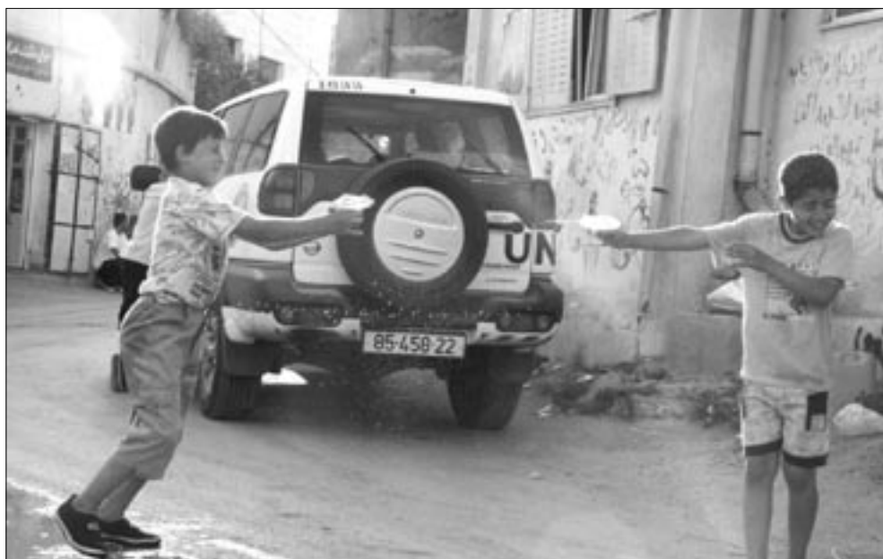
UNRWA car pass children in Deheishe camp.

Humanitarianism has been transformed into the primary manifestation of international political will as donor states condition additional aid (beyond that required to keep Palestinians alive) on Palestinian acquiescence to conditions that Israel itself has yet to fully accept.