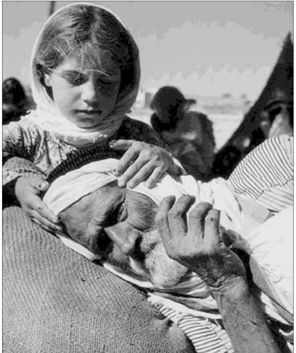
Palestinian Displacement (Nakba), 1948.