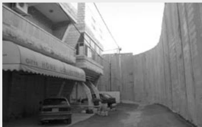
Palestinian house located a few meters away from the Wall build for the new colony, Bethlehem, May 2006.

The situation of the Palestinians living nearby the new Rachel's Tomb colony and military compound is alarming. Alarming is also the silence of the