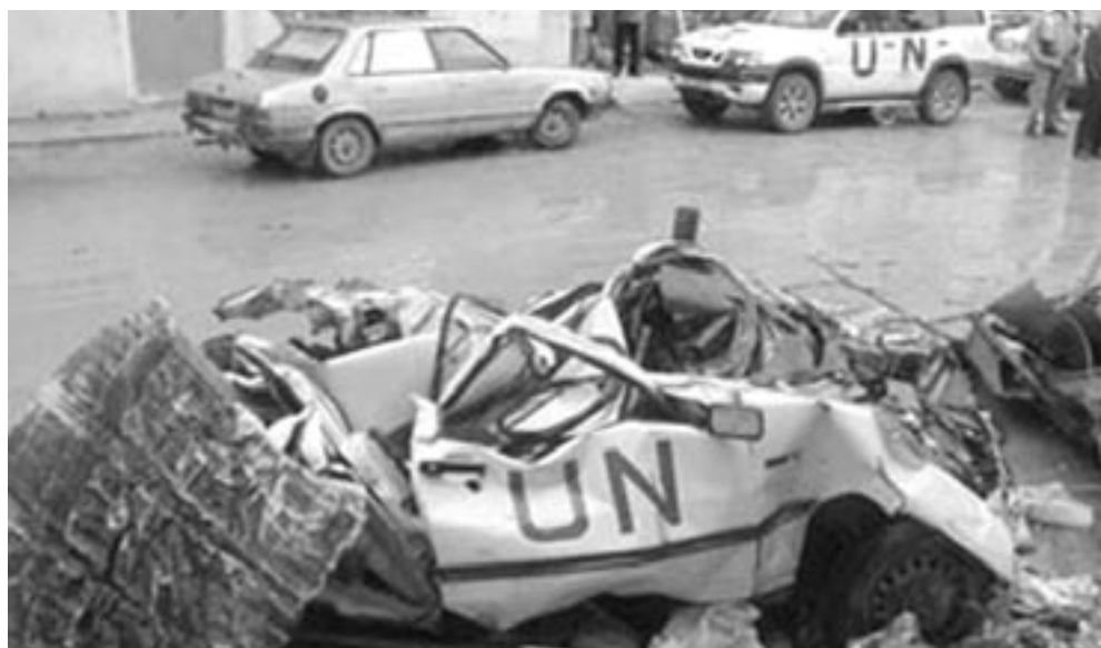
UNRWA car crashed by Israeli tanks, Jenin camp, 2002.

While donors are looking towards agencies like UNRWA, OCHA and WHO to deliver aid cut from the PA, the latter emphasize that they cannot be, in the words of Médecins sans Frontières, a “social palliative” of retaliatory donor measures or stand in the shoes of the PA and its 150,000 plus employees.