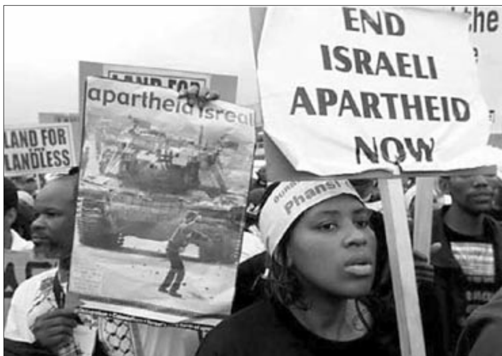
World Social Forum, Durban, South Africa, August 2001.

1948 remains the most important year for South Africans and Palestinians. For both peoples, British colonialism created the conditions for the racist entitlement by others of the land of indigenous people. The year 1948 saw the birth of Apartheid South Africa and the creation of Apartheid Israel.