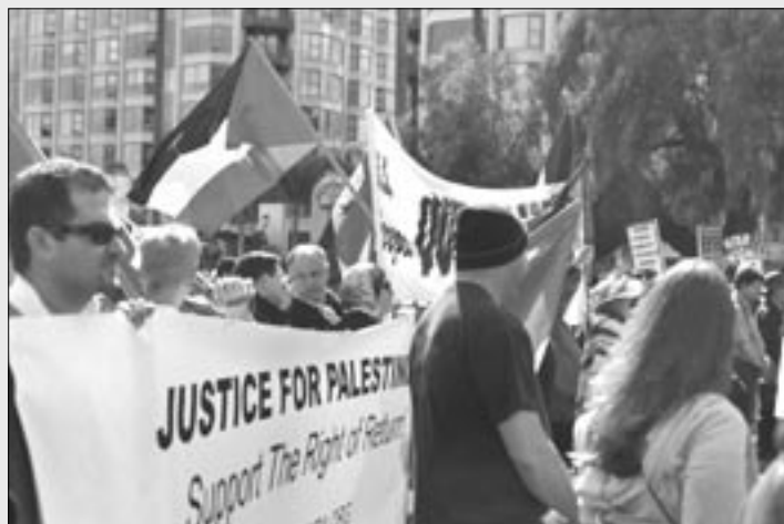
Nakba commemoration, San Diego, May 2006.

Despite Israeli military checkpoints which prevented access to Ramallah from the northern West Bank on Nakba Day, thousands joined the central memorial rally on Manara Square, Ramallah. Tens of thousands joined a parallel rally in Gaza as well as local memorial events organized in numerous towns and refugee camps.