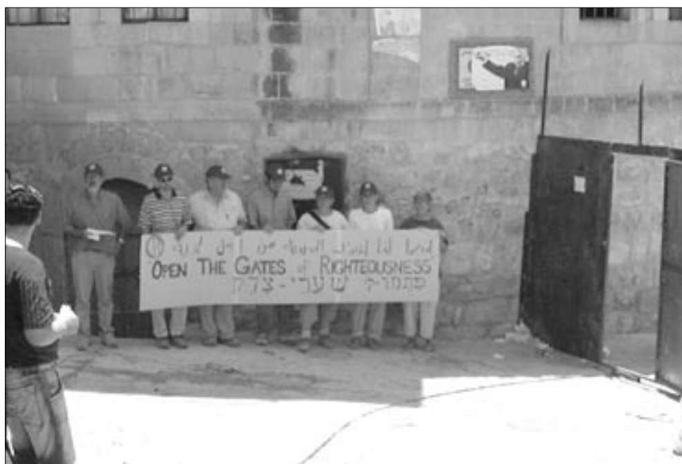
CPT delegation holds sign near the Hebron Rehabilitation Center.

Both statements thus warn that critiques of Zionism and of the “legitimacy of the State of Israel” are akin to anti-Semitism. While “anti-Zionism” is left undefined, Zionism is implicitly defined by these statements as the movement to establish “a Jewish state,” so anti-Zionism must therefore be understood to be a theological or political position that at least questions if not opposes the justice of establishing and maintaining a “Jewish state.” From this perspective, recognizing the State of Israel’s “legitimacy” is bound up with recognizing it as a “Jewish state.” A reader of these documents is left with the understanding that Christians, while they might criticize particular Israeli policies or actions, should affirm Zionism and recognize the justice of “the establishment of a Jewish state.”