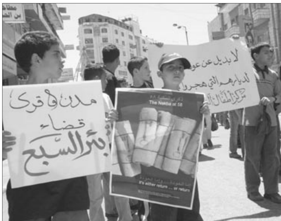
Nakba commemoration, Ramallah, May 2006.

By some miracle of the general will, every Palestinian has somehow, through all of the different journeys, arrived together at the same place.