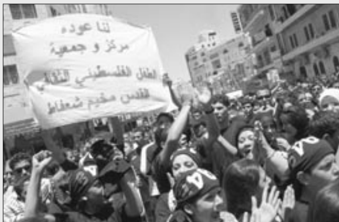
Nakba commemoration, Ramallah, May 2006.

Throughout 2005, young Palestinian activists helped to organise over 100 civic meetings in Palestinian refugee camps and exile communities in over 28 countries in order to bring Palestinians together to discuss the things that Palestinians want to do next. The most promising thing I witnessed at