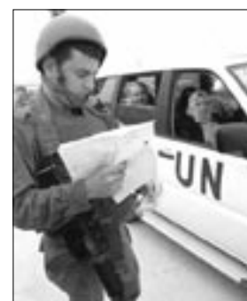
Israeli soldier checking traveling permits of UNRWA staff, Tulkarem 2004.

Since the beginning of the Israeli-Palestinian conflict, donor assistance has helped to feed, clothe and shelter Palestinians. Through donor-assisted programs, Palestinians have become one of the most highly educated peoples in the Arab world. And donor funds have financed the infrastructure of a future Palestinian state to the tune of more than USD 7 billion. Palestinians