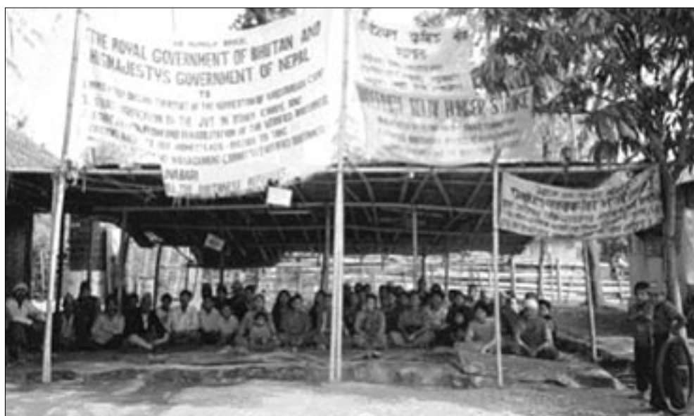
Bhutanese refugee in Khudunabari camp in Jhapa district, eastern Nepal.