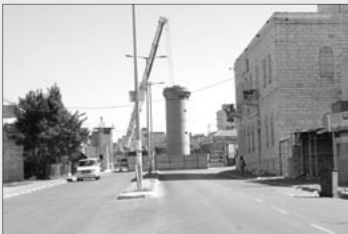
Construction of the Wall and military tower surrounding the new colony, Bethlehem, May 2006.

After the 1967 Arab-Israeli War, the Israeli government prohibited the return of all Palestinians who were outside the West Bank and the Gaza Strip. This affected thousands of people who became refugee sur place . Israel's military occupation, the tense political situation, arrests, assassinations and house demolitions triggered more forced displacement of Palestinian communities from the occupied Palestinian territories. Thousands of Palestinian workers