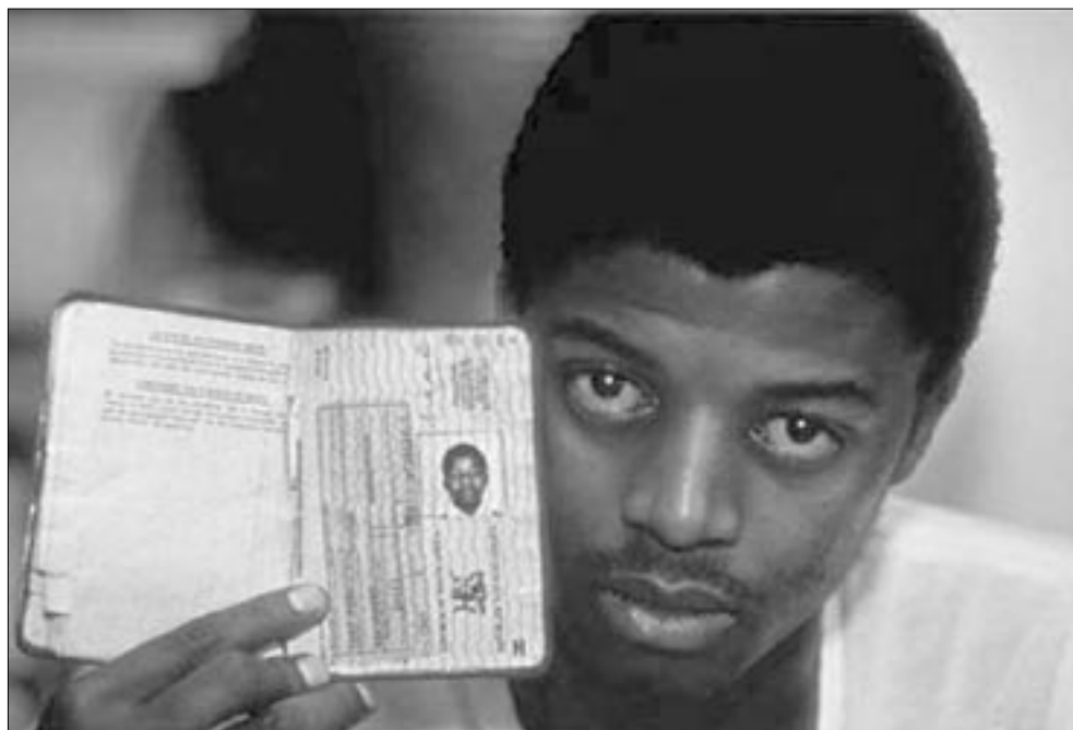
A Black South African shows his passbook issued by the Government. Blacks were required to carry passes that determined where they could live and work.

Jews and Arabs, Christians and Muslims, live together with equal rights. Just as importantly, there can be no solution without the right of return of the refugees and their children.