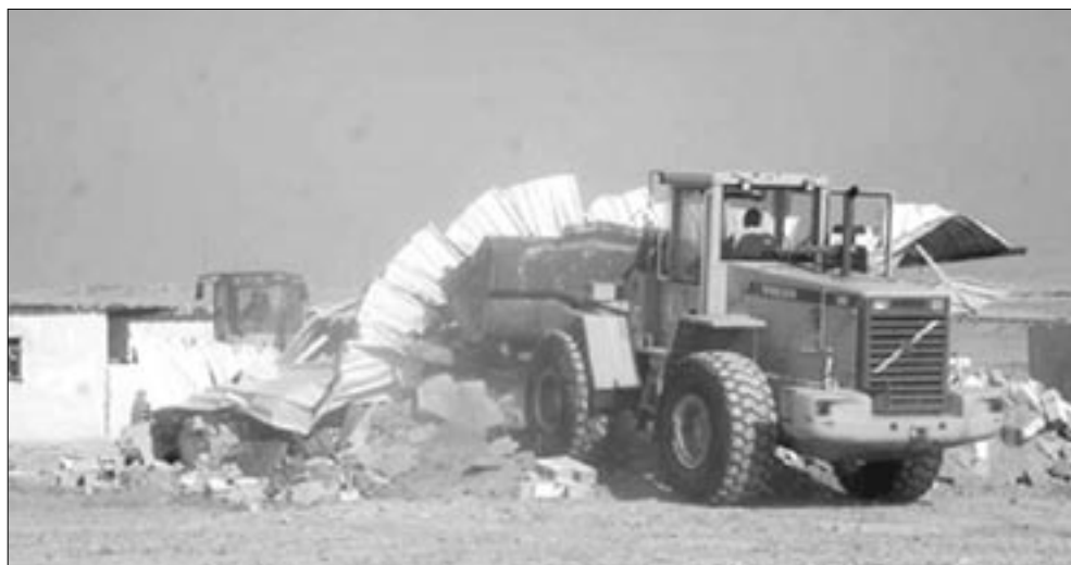
Israeli Police demolish the houses of Palestinian Naqab Families, October 2005.

It is important that the Council of the Unrecognized Villages demands the recognition of the ownership rights of all Internally Displaced in the Nakab, so that they can relate to their past.