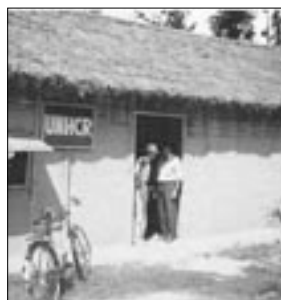
After 15 years in exile, frustrations are growing among 105,000 Bhutanese refugees in seven camps in eastern Nepal. UNHCR is urging them not to go home on their own.

a so-called "Voluntary Migration Form" at gun point. These individuals are considered to have renounced their nationality under the terms of the 1985 Citizenship Act. The exodus of hundreds of thousands of people into Nepal provoked a humanitarian crisis. At the request of the Nepalese Government, the UN High Commissioner for Refugee (UNHCR) established a Bhutanese Refugee Camp in South-east Nepal in 1991.