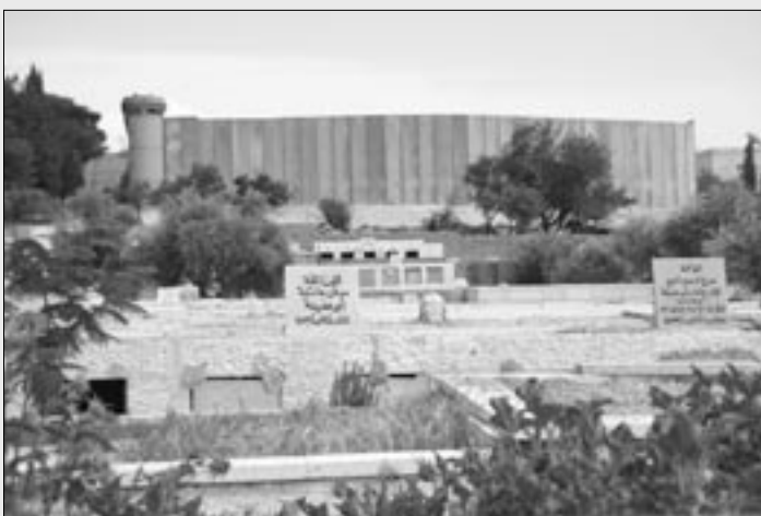
Wall surrounds the new colony next to Aida camp cemetery, Bethlehem, May 2006.

Colonization also continues in eastern Jerusalem. In March 2006, two new colonies were created in two highly populated and strategic areas in eastern Jerusalem. In Silwan, settlers evicted five Palestinian families while two families were expelled from a three-story apartment buildings in A-Tur on the Mount of Olives. While media attention has lately focused on the eviction of a few settlers in Hebron and on Olmert's plan to evacuate some colonies from the occupied West Bank, facts on the ground demonstrate the ongoing Israeli colonization and annexation of Palestinian lands in strategic areas.