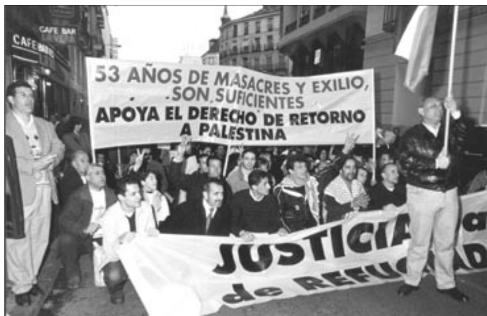
Nakba commemoration, Madrid, May 2001.

Identifying the Palestinians as refugees is to recognize that there exists a problem requiring a solution. To qualify them as diaspora, is to eliminate the language necessary to change their situation.