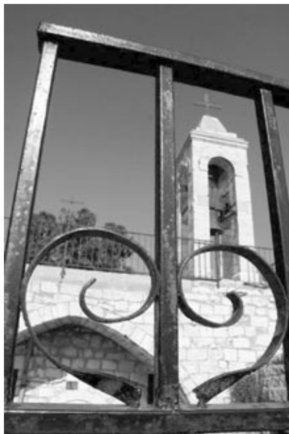
Church in depopulated Bi'r'im village, Safad, July 2005.

All components of Christian Zionism are informed by a particular theology (termed premillennial dispensationalism) that reads the biblical story as pointing towards an apocalyptic end of history in which the founding of the State of Israel and the in-gathering of the exiled Jewish people plays a decisive role in precipitating the last battle of Armageddon in which the anti-Christ/Satan is decisively defeated.