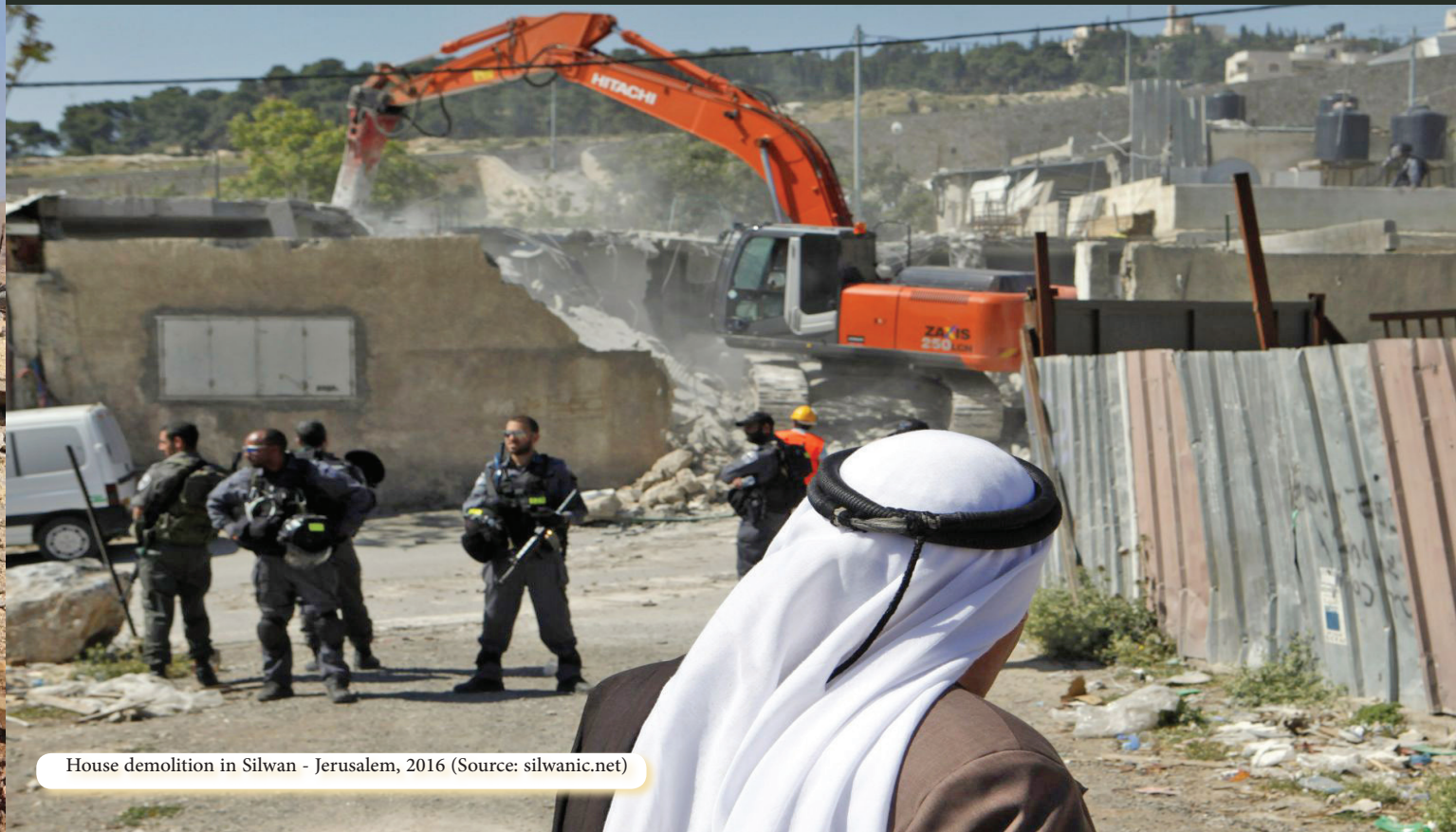
House demolition in Silwan - Jerusalem, 2016