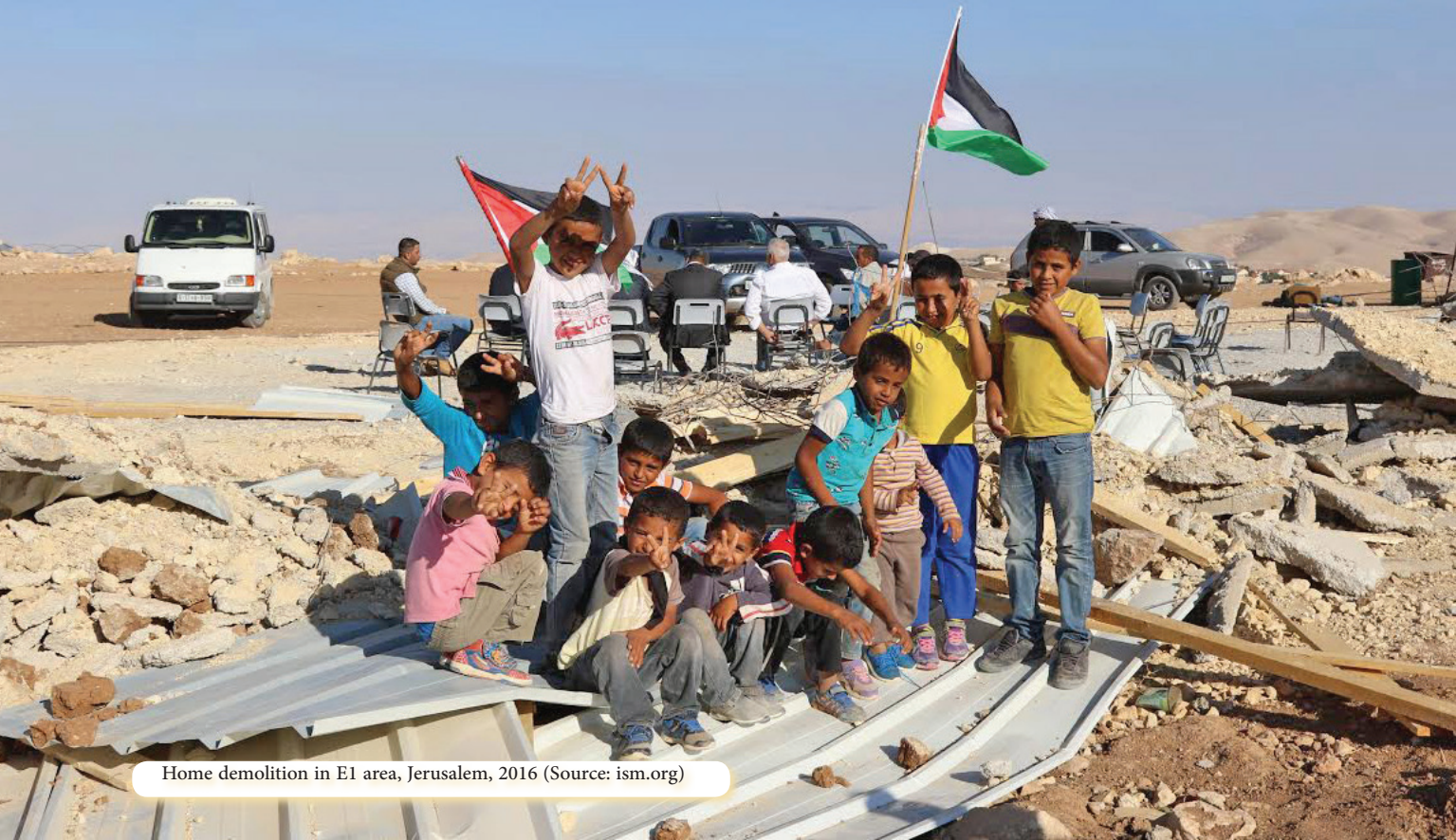
Home demolition in E1 area, Jerusalem, 2016

As such, third party states, international agencies including the UN and regional bodies such as the EU are obligated to intervene to (1) provide international protection to Palestinians and (2) hold Israel accountable.