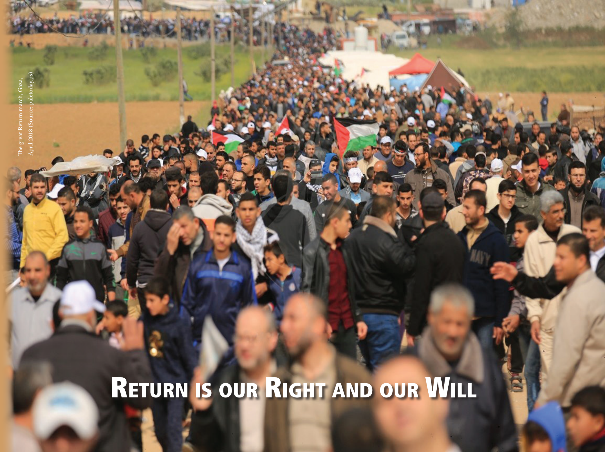
The great Return march, Gaza, April 2018