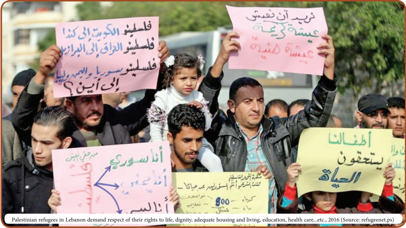
Palestinian refugees in Lebanon demand respect of their rights to life, dignity, adequate housing and living, education, health care...etc., 2016

According to Article 41 of the Articles on Responsibility of States for Internationally Wrongful Acts, States have both a positive duty to affect the cessation of unlawful acts; and a negative duty of abstention to refrain from recognizing or treating the situation as lawful.