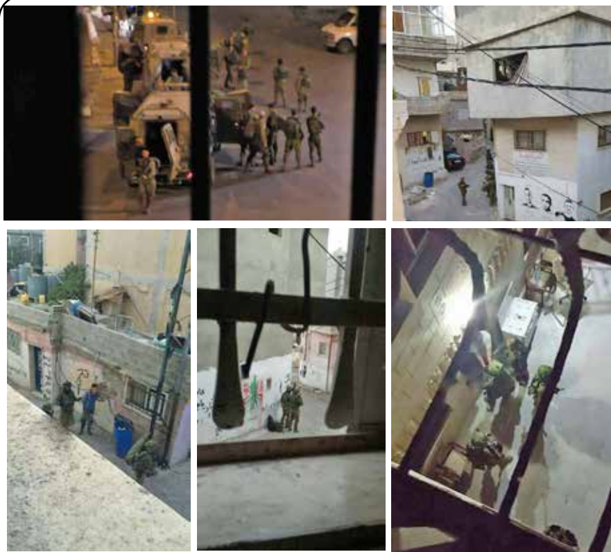
Israeli occupying forces inside Dheisheh Refugee Camp. Images were taken by residents of the camp during raids in 2016 and 2017.