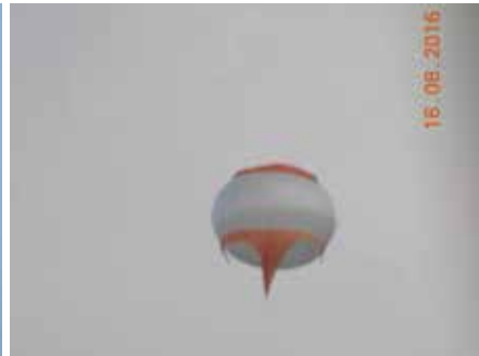
Israeli drone and zeppelin patrolling the movement in the Camp.