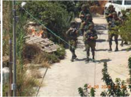
Israeli occupying forces being deployed inside al-Fawwar Refugee Camp on 17 August 2016.