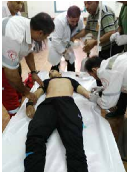
Palestinian youth receiving medical care in al-Fawwar after being shot by Israeli forces.