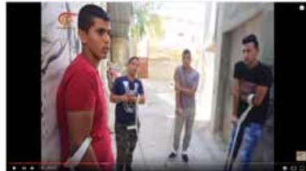
Screenshots of a video published by al-Mayadeen News: ( https://www.youtube.com/watch?v=u4SvZ3gihPc ).

Following BADIL's preliminary research into excessive use of force and intentional injury of Palestinian youth by Israeli forces, al-Mayadeen News decided to produce this video report on the topic. The short documentary covers different cases of excessive use of force across the West Bank, including Dheisheh Camp.