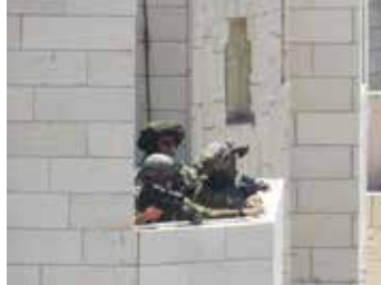
Israeli army snipers stationed in the homes of residents of al-Fawwar Refugee Camp.