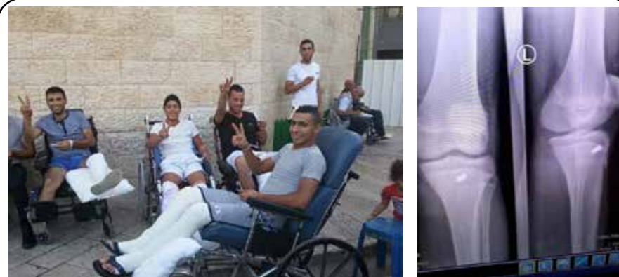
A group of injured youth from Dheisheh at Bethlehem Arab Society for Rehabilitation Hospital in 2016. On the right, an X-Ray image showing a bullet lodged in the knee of one of the youth.