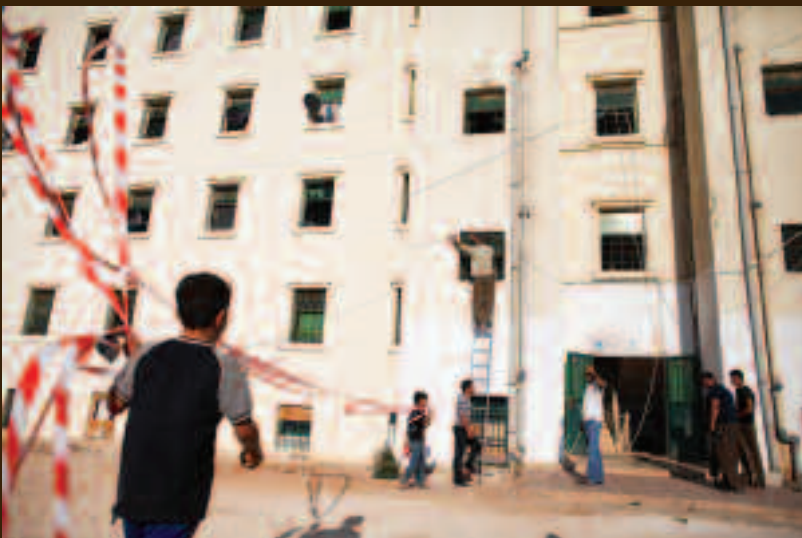
Refugees at the Cyber City refugee camp near Ramtha, Jordan, July 21, 2012. Jordan has prevented Palestinians from Syria from entering Jordan since 2012, and is holding 190 Palestinians at the closed Cyber City refugee camp, where they have the unenviable choice of remaining in the camp indefinitely or returning to Syria.

Jordan is not the only country neighboring Syria that has placed entry restrictions on Palestinians from Syria. Other than Turkey, all of Syria's neighbors have placed onerous restrictions on entry for Palestinians attempting to flee generalized violence and unlawful attacks by both government forces and non-state armed groups. All neighboring countries must respect the rights of Palestinian refugees to seek safety and asylum outside Syria as long as they face insecurity and persecution there.