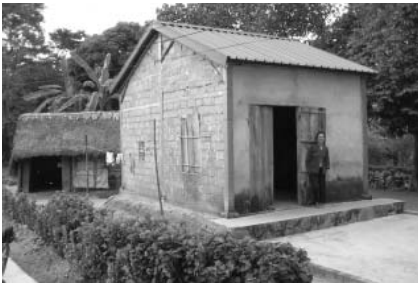
A starter house built by the Vietnamese Red Cross in Huyen Ky Anh, Ha Tinh province, Vietnam