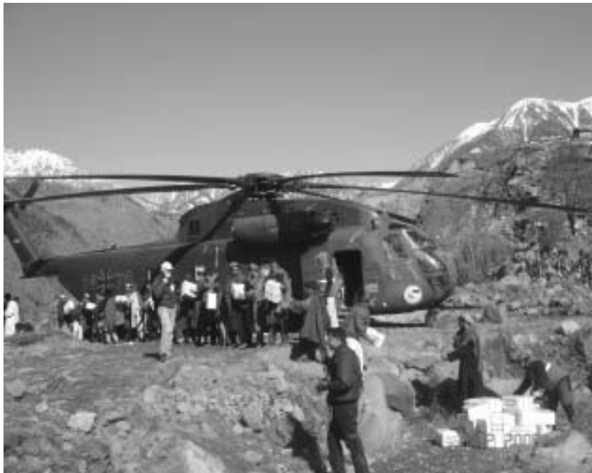
A German military helicopter transporting relief items for the Pakistan Red Cross and IFRC following the earthquake in 2005

While the involvement of the military in relief operations is not new (think of the 1948–49 Berlin airlift, for example), military engagement in relief activities has grown since the early 1990s. Military resources were used in response to the 1991 cyclone in Bangladesh, and after Hurricane Mitch in Central America in 1998. More recently, the US military supported the response to Hurricane Katrina in 2005, the UK military was brought in to help tackle floods in Britain in 2007 and huge numbers of Chinese troops were deployed in the aftermath of the earthquake in Sichuan province in 2008. Following the October 2005 earthquake in Pakistan, domestic and international military actors mounted the largest humanitarian helicopter airlift ever seen. Regional alliances too are paying growing attention